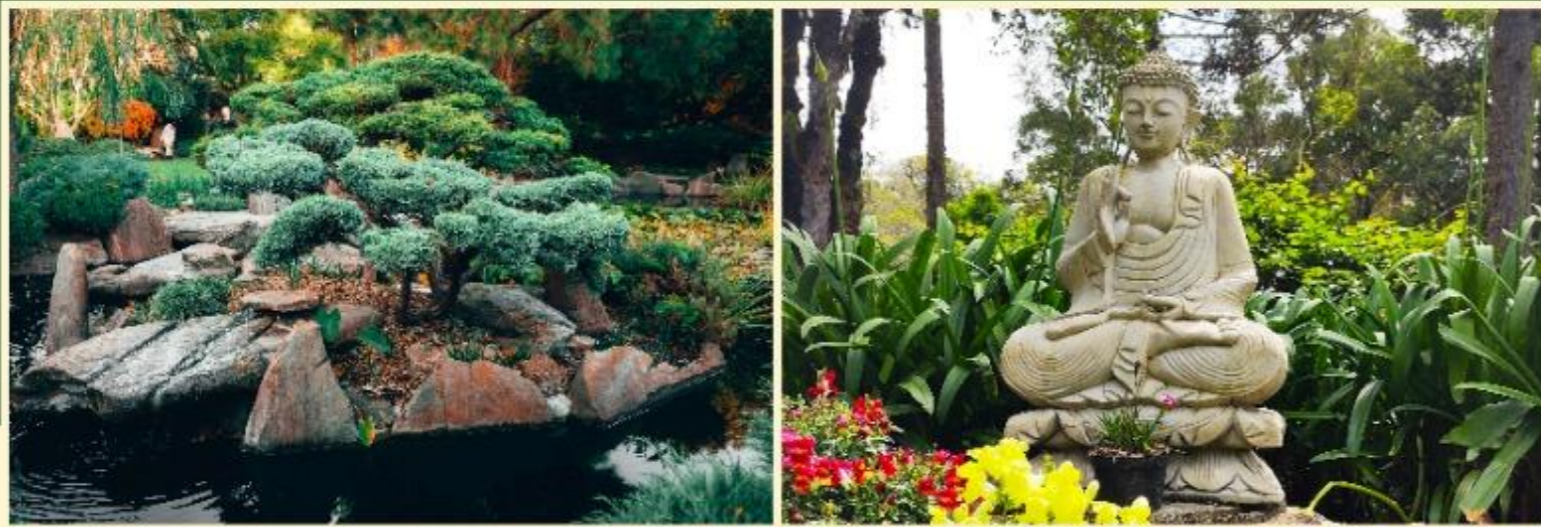
Zen Style Garden Theme