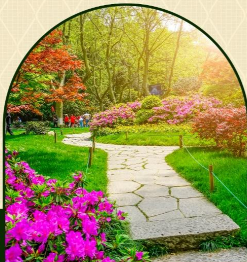
Lush Green Garden