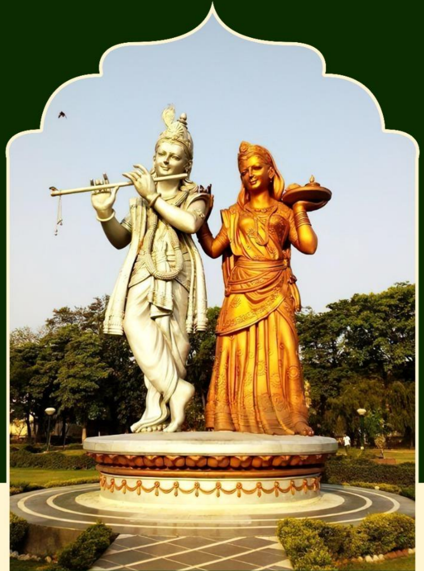
Tallest Radha Krishna Statue